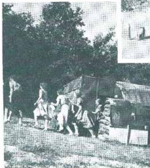
Below right: trying out the rope ladders.