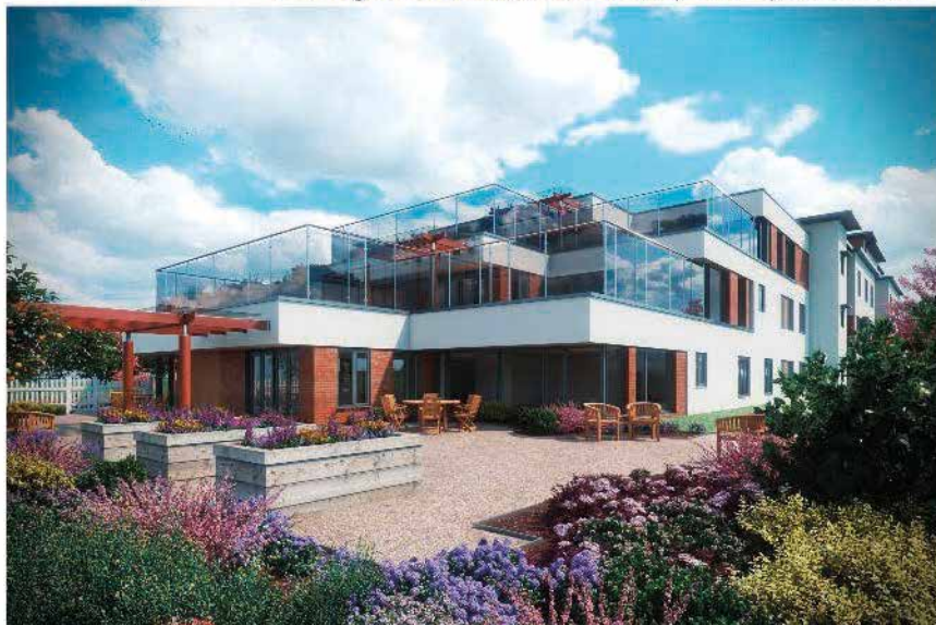
Artists impression of the Home

Caring for the nation's military family since 1916