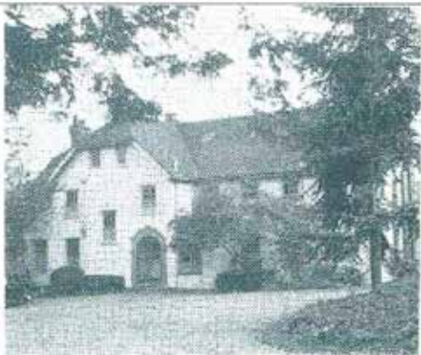
Below: the main entrance.