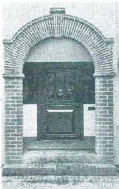
Below: deeds stored in the passageway leading to the strong room.