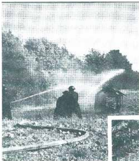
Left and below: members of the staff fire-fighting team.